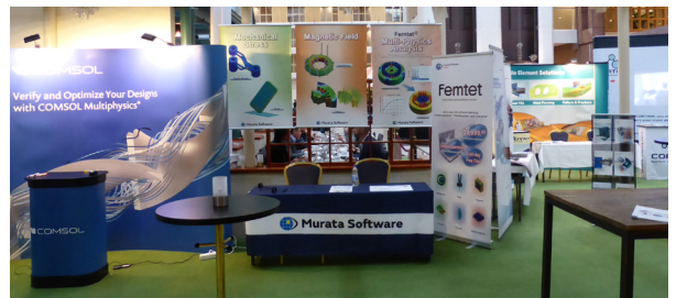
Exhibition area in front of the conference rooms

If you are interested in participating as an exhibitor or sponsor, you can find an information brochure at www.nafems.org/nordic24 .