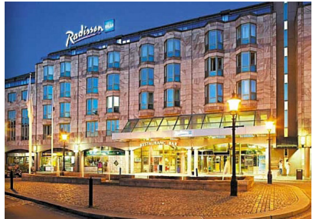
Radisson Blu Scandinavia Hotel